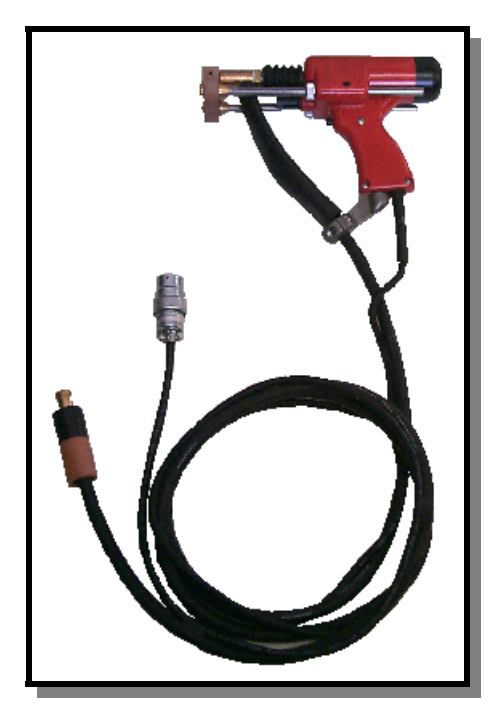
NOTE: Chuck and ferrule grip are not standard and must be ordered separately

Includes standard legs and foot piece plus approximately 8 ft of 1/O weld cable and connectors.