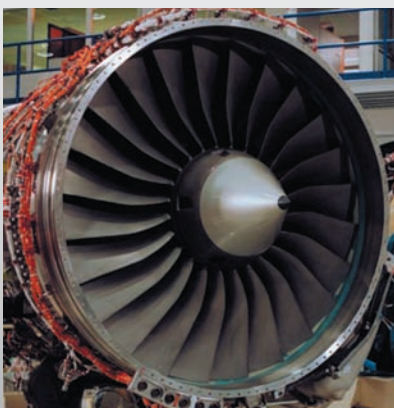
Primer-Free inserts are ideal for use in aerospace applications