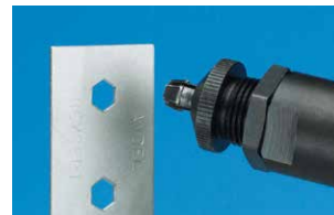
Workpiece with the hexagonal hole stamped by the 74290, ready to take a Hexsert® threaded insert