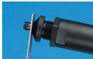
Insert the punch (fixed onto the 74290 tool) into the round hole