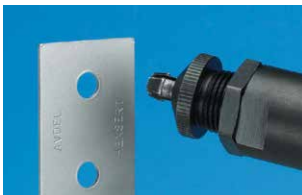
Workpiece with round hole