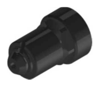
TP143-665 TRM00115 TP143-646