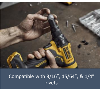
Compatible with 3/16", 15/64", & 1/4" rivets